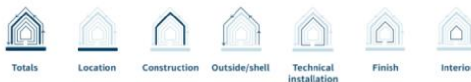
Figure 2 Building Layers in Madaster

Materials and products used in a building are categorized in the Madaster Platform and assigned to various building layers. This indicates the location of the materials and products in the building. In addition to architectural and constructional elements, Madaster also has the option of classifying technical installations, interiors and elements in the vicinity of the building (such as pavements, etc.). Depending on the building owner / developer's objectives, it is determined from which building layers a materials passport is expected, which ultimately results in one Building Passport.